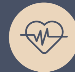
State-of-the-art cardio equipment