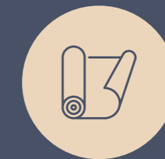
Functional fitness area