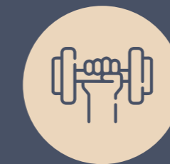
A variety of strength equipment